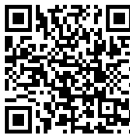
ICPerMed Action Plan

https://www.icpermed.eu/en/activities-action-plan.php